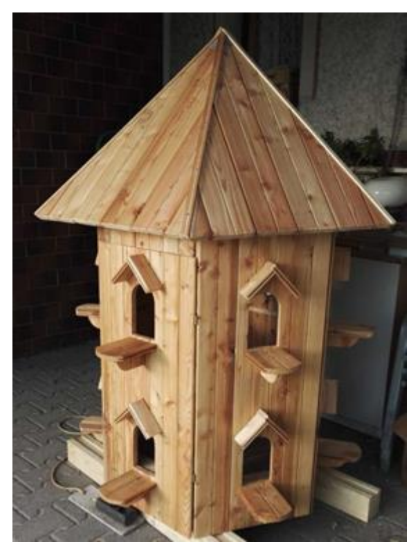
Example of nesting boxes and seating perches